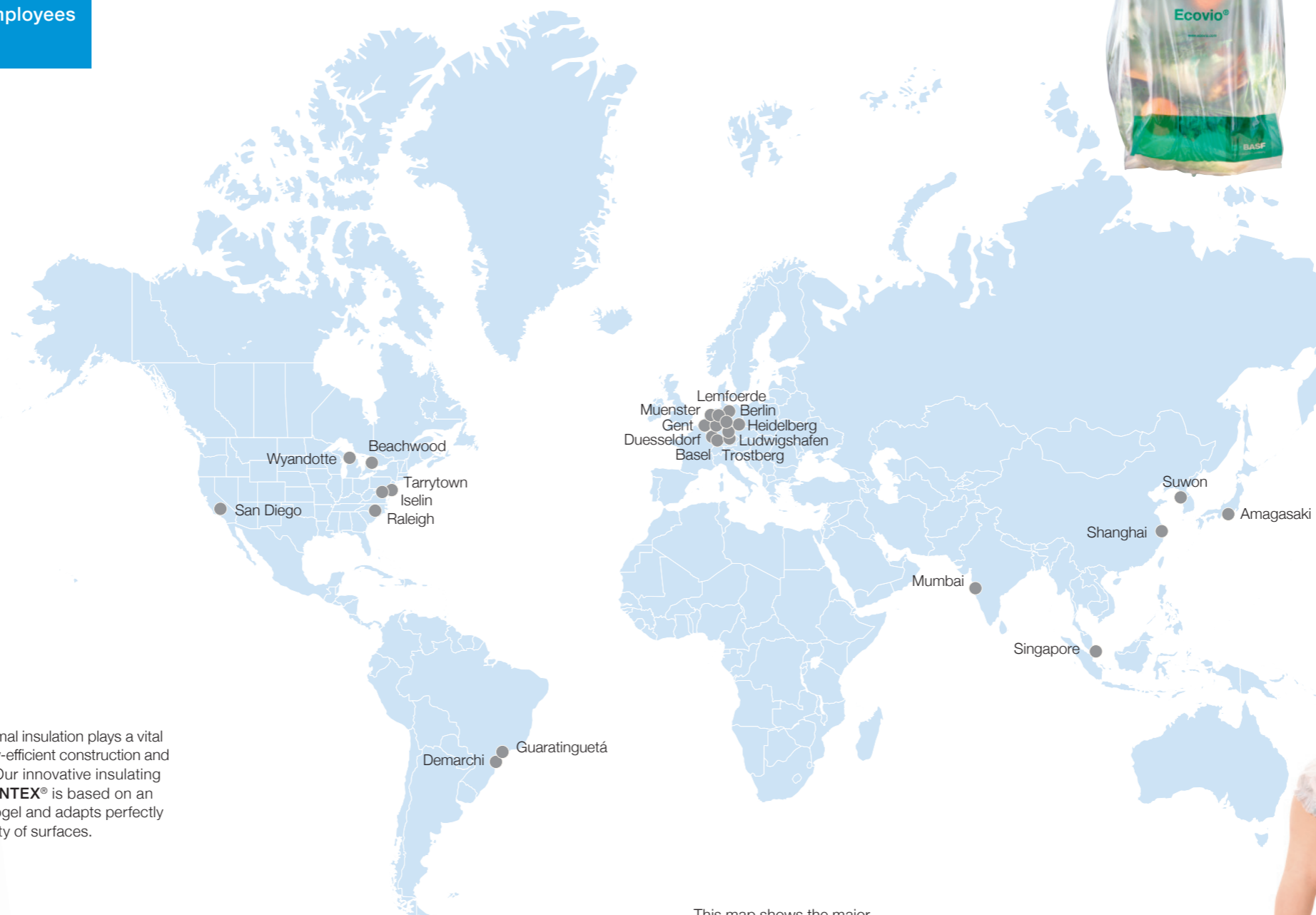
This map shows the major BASF R&D locations worldwide.

At some point, any diaper needs changing – but thanks to BASF, the baby stays dry. We have developed super absorbers that can store large amounts of liquid – not only in diapers.